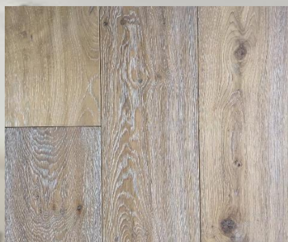
Marseille XW FOR 7UVP MARSEILXW 30.92 SF / CTN 1/2" x 7.5" x RL (24"-74.86")