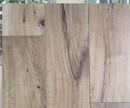
Castile FOR 7UVP CASTILE 30.92 SF / CTN 1/2" x 7.5" x RL (24"-74.86")